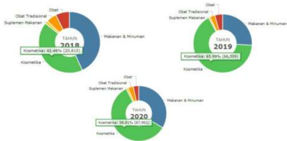
Figure 1 Products that are widely circulated in Indonesia in 2018-2020 Resource from: "Produk BPOM - BPOM RI," (2021)

As per figure 1 (BPOM) data from the Food and Drug Administration regarding products (Badan Pengawasan Obat serta Makanan) that are available in Indonesia in 2018 the number of cosmetics circulating in Indonesia as much as 42.26% who use the total products that have been in circulation amounted to 20,6010, then in 2019 experienced a very high increase of 65.99% using a total of 66,309 products and even in 2020 also experienced a very high increase of 58.81% from the total products of 67,902 and products Cosmetics in circulation for five years reached 198,326. (BPOM) The Food and Drug Administration continues to conduct and support the growth of this cosmetic industry so that Indonesian cosmetic products can meet the requirements, safety, benefits, and quality.