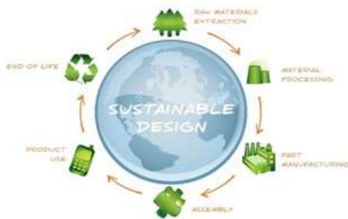
Figure 1 Sustainable Design

According to Mita Purbasari (2000: 12-119), Product design with the concept of Eco-Friendly aims to develop environmental awareness both in the product and its processes. The application of this concept involves a specific framework aimed at considering environmental issues and is also a challenge for practitioners engaged in product design both in design and in manufacturing. But in the past, the impact on the environment was ignored during the product design and processing process. This is difficult to change just like that because it reminds of the manufacturing process that already exists and has been running for a long time, it is not possible to experience changes quickly and significantly which actually has positive aims to effectively balance the environment.