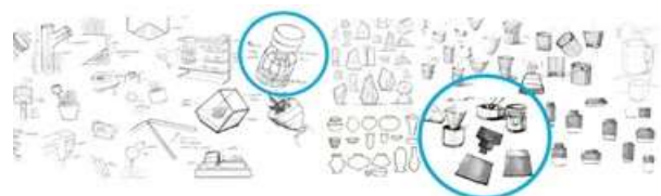
Figure 4 Brainstorming Sketch

1. The process of brainstorming a sketch of a plant pot, based on the analysis that has been done