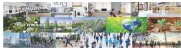
Figure 2 Moodboard

Moodboard is a collection of concepts that become a single entity that visualizes a character in the process of designing a product. The concept for this design the author combines a minimalist organic form. with colors inspired from nature.