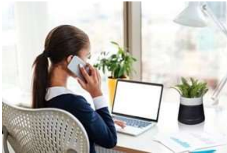
Figure 16 Example of Product Usage

The following are examples of the use of potted plants with eco-friendly concepts and the addition of self-watering features.