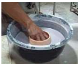
Figure 12 Grading

Glazing is the stage that is carried out before burning the glaze. Ceramic objects biscuit glaze coated by dipping.