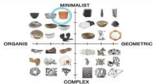
Figure 3 Styling Board

The following is a comparison of concepts and products between one and another so that they find concepts that are truly in accordance with the results of interviews, observations & documentation that have been done by the author.