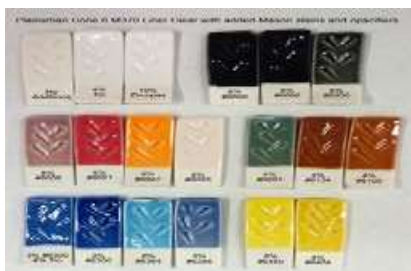
Figure 7 Color Ceramics

The following application is the choice of colors for plant pot products, with the glaze technique on keramik products, the authors chose a neutral color which turned out to be the most favorite color for people to apply to the room. Neutral color is no longer a new trend used indoors. Colors such as black, white, and gray have actually been widely used since ancient times by people for specific purposes