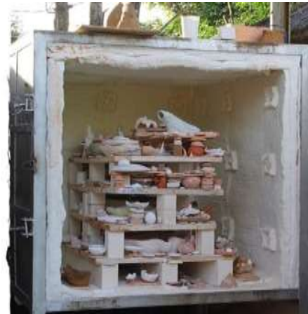
Figure 13 Combustion

several important reactions, loss / emergence of mineral phases, and weight loss.