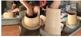
Figure 10 Formation

The stage of designing potted plants with an eco-friendly concept and the addition of self-watering features using a rotary technique, follows the formation process: