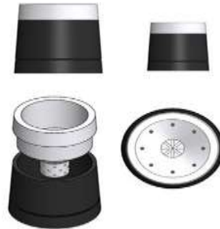
Figure 8 Final Desain

The following are the results of the selected designs, along with a mechanism system that will be applied to the design of potted plants with eco-friendly concepts and the addition of self-watering features. Figure 8 Final 3D Model