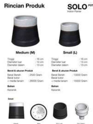
Figure 15 Product Details

The following is a picture of product details as media info about product details starting from the name, variation, size & weight of the product.