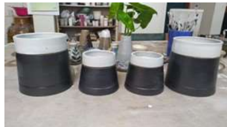
Figure 14 Final Product Results

Following are the final results in the process of designing potted plants with eco-friendly concepts and adding self-watering features.