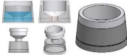
Figure 5 3D model

The following are the results of developing along with the detailing process of the pelengkap components in the design of mini plant pots with self-watering features made from environmentally friendly materials.