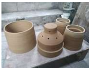
Figure 11 Drying

After the ceramic object has been formed, the next step is drying. The main objective of this stage is to remove the plastic water that is bound to the ceramic body. To avoid drying too fast which will cause cracked ceramics, in the early stages ceramics should be aerated in the room / not exposed to direct sunlight, a drying machine can be done.